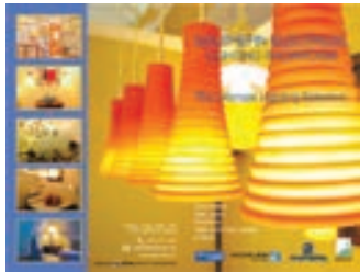
Southern Electrical Showroom Brochure