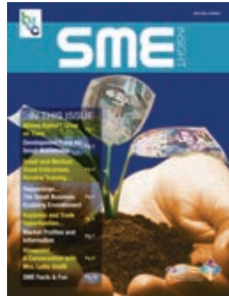
GIDC | Business Development Centre Newsletter