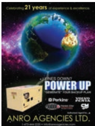
Anro Agencies Ltd Poster