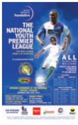
Jason Roberts Foundation Poster