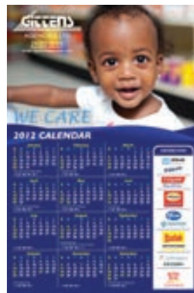
Gittens Agencies Ltd Calendar