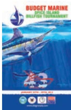
Spice Island Billfish Tournament Brochure