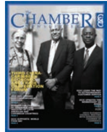
Grenada Chamber of Industry & Commerce Newsletter