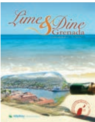
Lime & Dine Visitor's Guide for Grenada