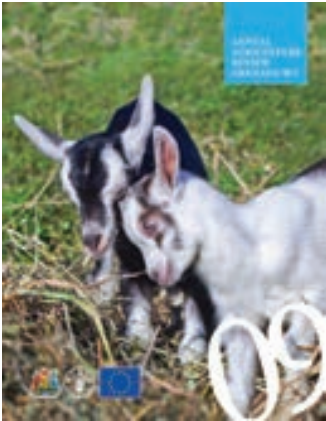
Ministry of Agriculture Annual Report