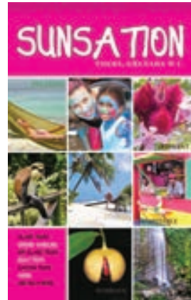
Sunsation Tours Brochure