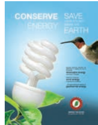
Grenada Electricity Services Ltd Print Ads