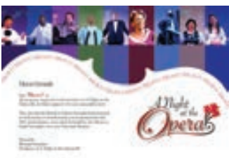
A Night at the Opera Mailshot