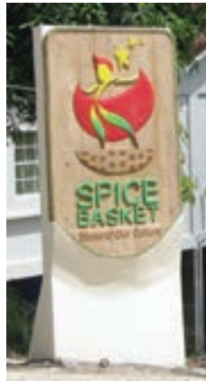
Spice Basket Signage