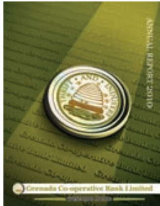
Grenada Co-operative Bank Ltd Annual Report