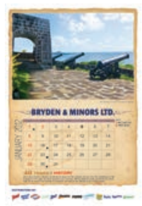
Bryden & Minors Ltd Calendar